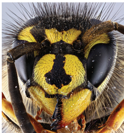
Wasps make up an enormously diverse array of insects, with some 30,000 identified species.

Pest controllers get thousands of call-outs to treat for wasps every year - so if you're having wasp issues, you're not alone! Whether you're thinking about doing some DIY wasp pest control, or you're looking to enlist the help of a professional pest management company , this guide's for you.