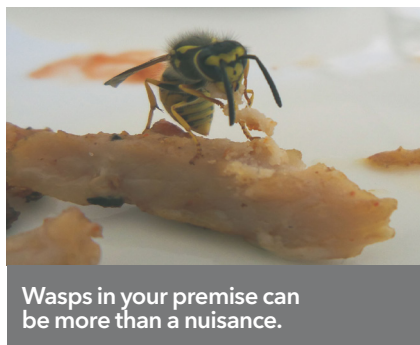
Wasps in your premise can be more than a nuisance.

You have a duty to protect your customers and staff. To minimise the disruption to your business, we suggest you contact a professional pest controller.