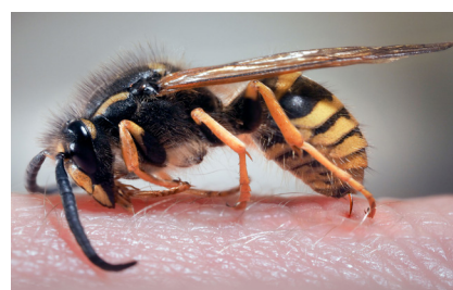
The sting of a wasp on a human hand. Note the swelling and redness.

If after a sting you have difficulties breathing, dizziness or a swollen face - you need to seek immediate medical treatment. If you've not had a severe allergic reaction, your sting will still be very painful. To treat a sting yourself: